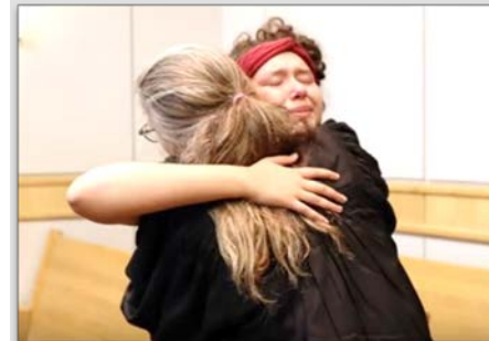
Serving Families in Crisis