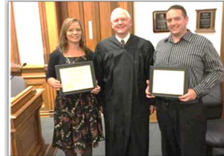
Treatment Court Graduates